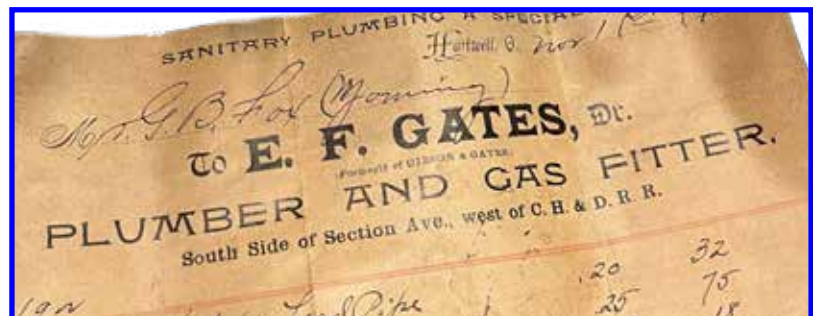
Plumbing receipt from 1900.

our neighbors – our unique street communities, community in education, and all the things bringing us together contributing to an unmatched quality of life. For us especially, our years living on East Mills Ave. have been wonderful because of our neighbors. As true as this is in today's Wyoming, I garner a strong sense this was as well the story 150 years ago.